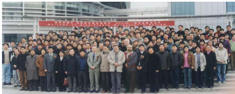
Fig. 3. “The Third Sino-French Scilab Workshop” in Xi'an (2003).