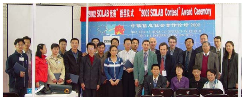
Fig. 4. Award Ceremony of “The First Scilab Contest” at “2002 Euro-China Forum on Information Society”.