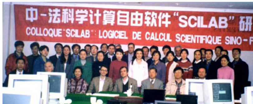
Fig. 2. “The First Sino-French Scilab Workshop” in Beijing (2001).

Up to now, several activities with regards to this promotion have been made with great success. For example, we have organized four “Sino-French Scilab Workshops” at Beijing (2001), Shanghai (2002), Xi'an (2003) and Xiameng (2004), respectively (Figs. 2-3). Three “Scilab Contests” were held nationally (Fig. 4).